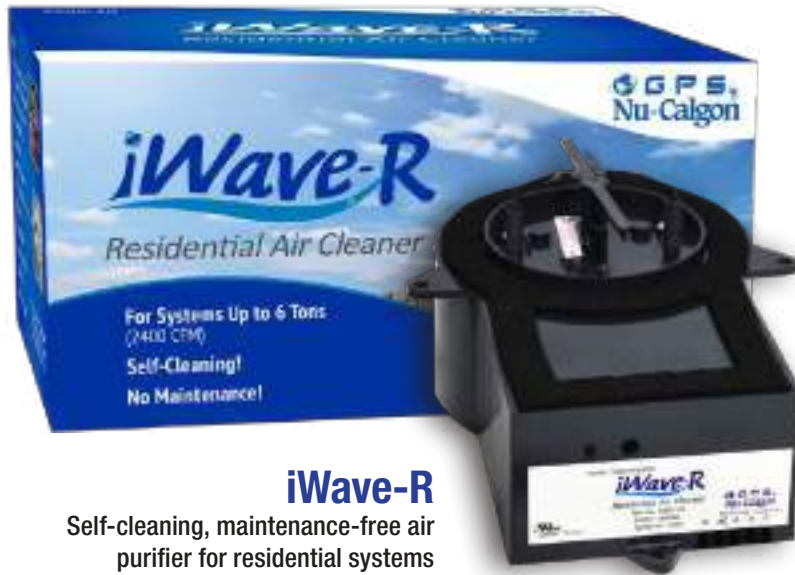
iWave-R Self-cleaning, maintenance-free air purifier for residential systems