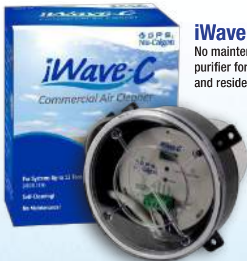
iWave-C No maintenance air purifier for commercial and residential systems