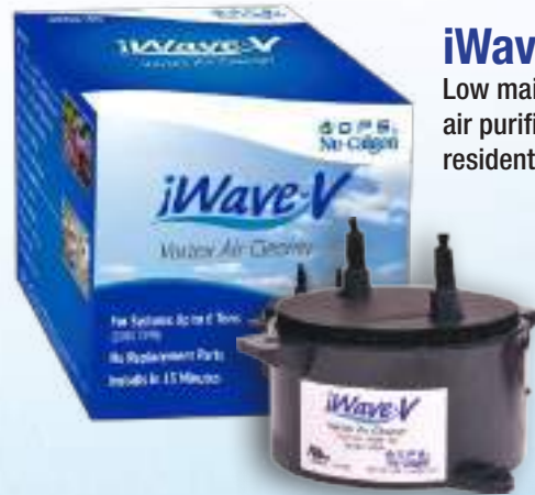
iWave-V Low maintenance air purifier for residential systems