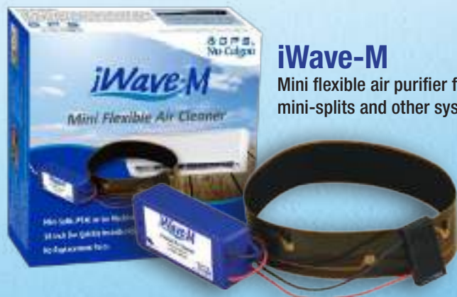
iWave-M Mini flexible air purifier for mini-splits and other systems